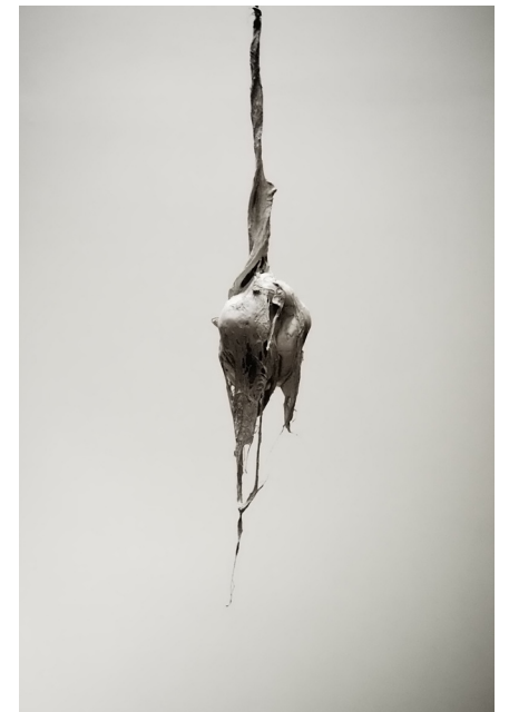
Détails d'installation, La chute, terre, porcelaine, fil, 2019