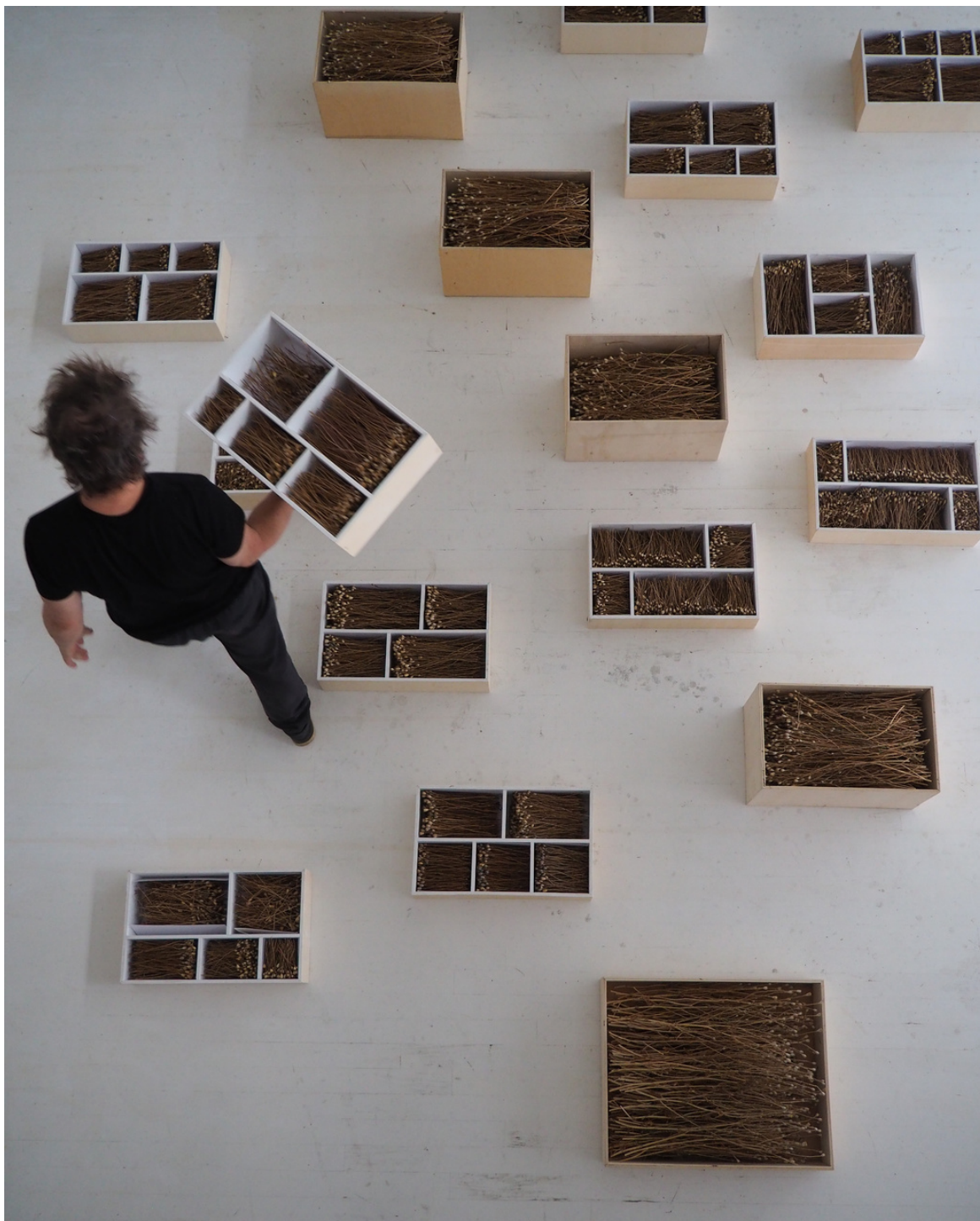
Installation , Ensemble de boîtes contenant des coquelicots, Classification, enregistrement du réel 2022