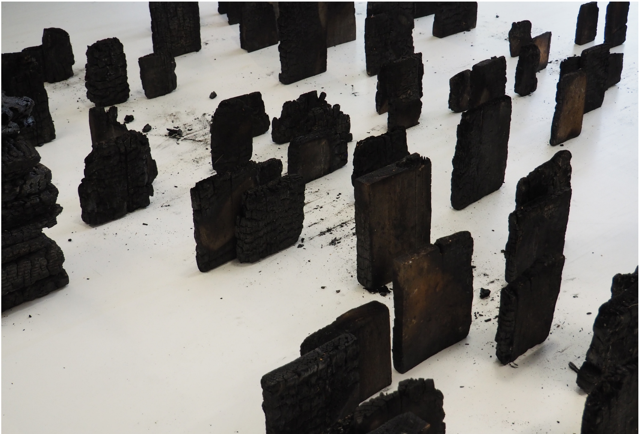
Installation, Isoler le savoir pour vivre le réel #1, Blocs de bois passés par le feu, 2022