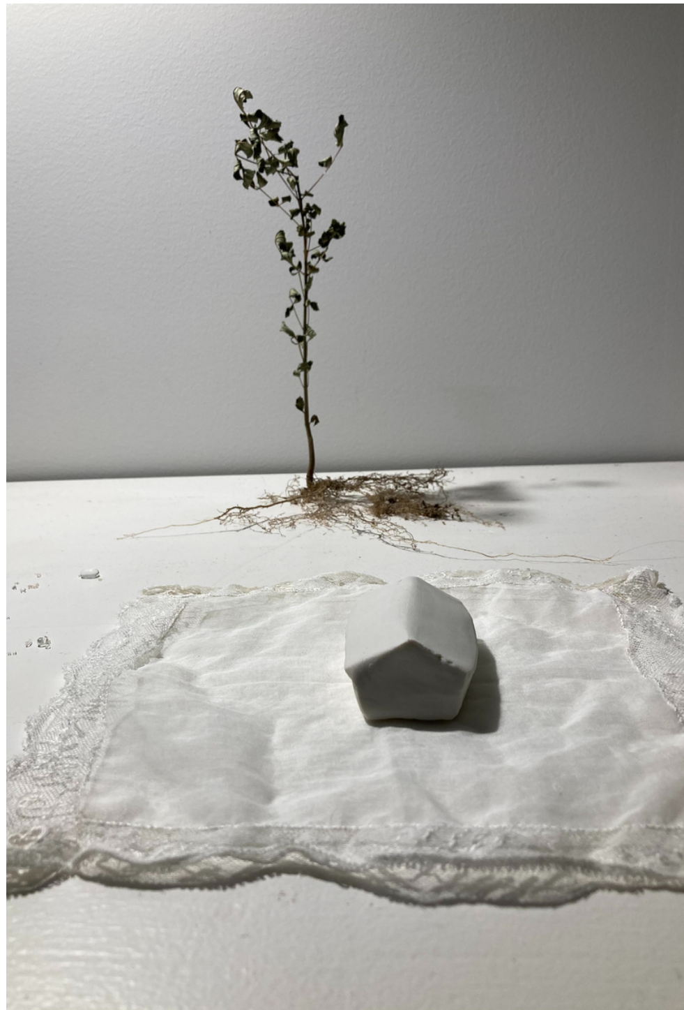
Détail d'installation, Demeure en porcelaine sur dentelle, 2022