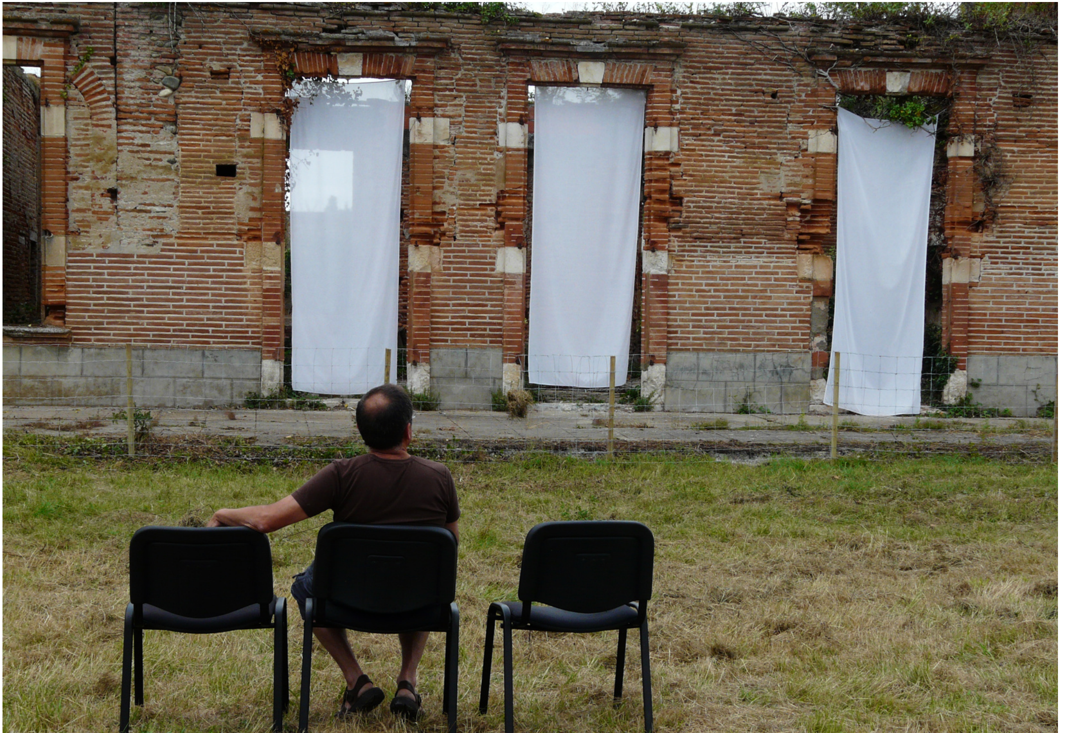
Ruine, Sentir l'air dans la suspension d'un temps, 2010