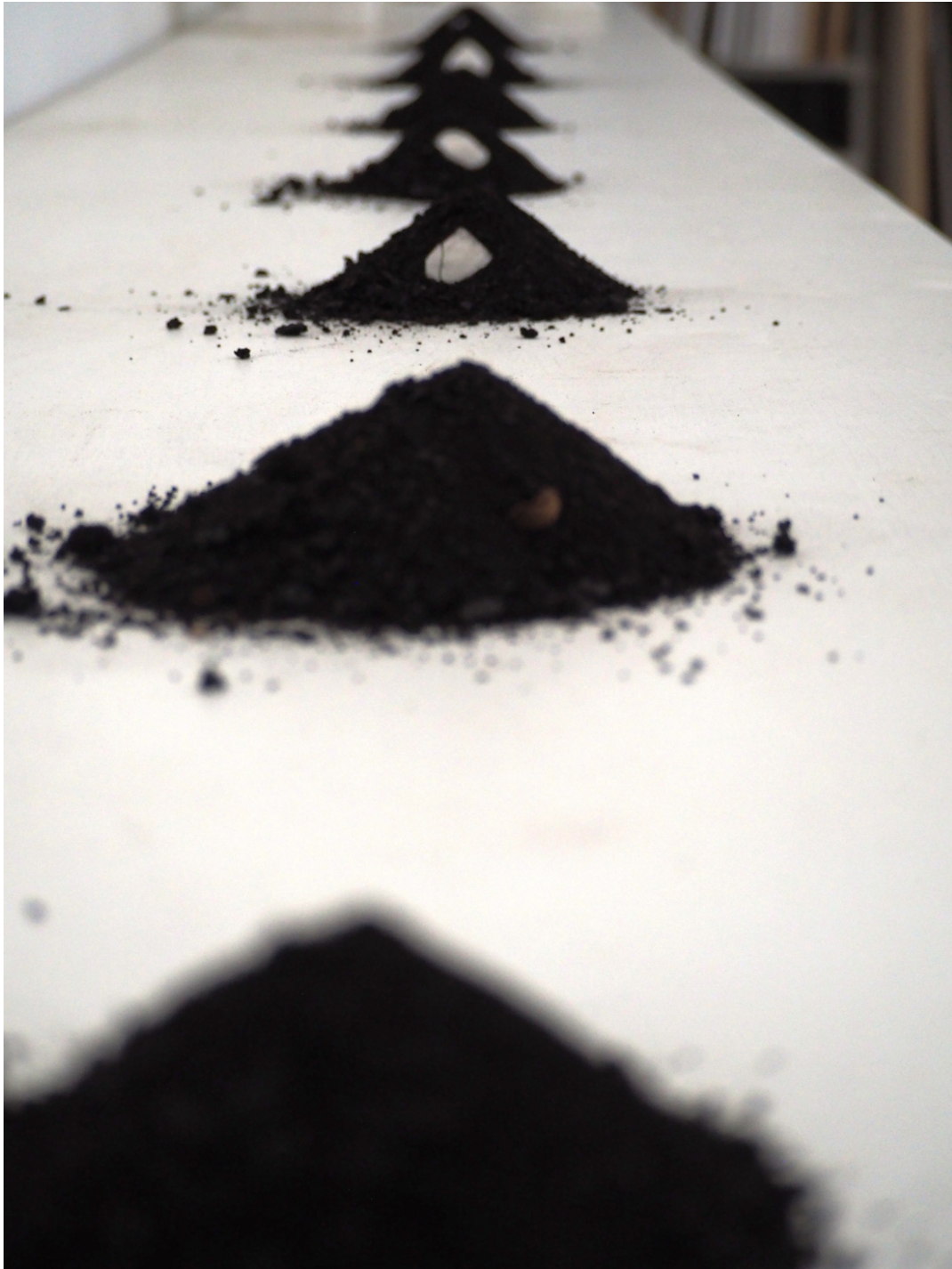
Installation, Demeures en porcelaine en dialogue avec la suie provenant du foyer, 2022