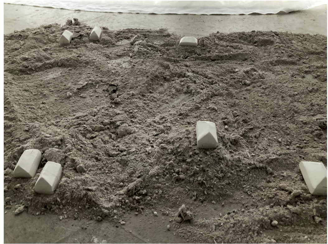
Installation, Demeures en porcelaine sur un paysage de cendres 2023