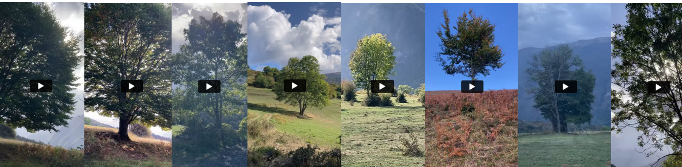
Installation, Vidéos, 33 arbres sur le chemin..., 2022