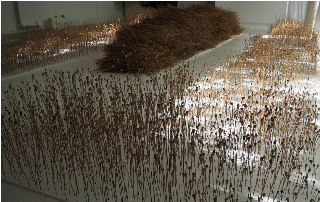
Installation, Coquelicots, 2022