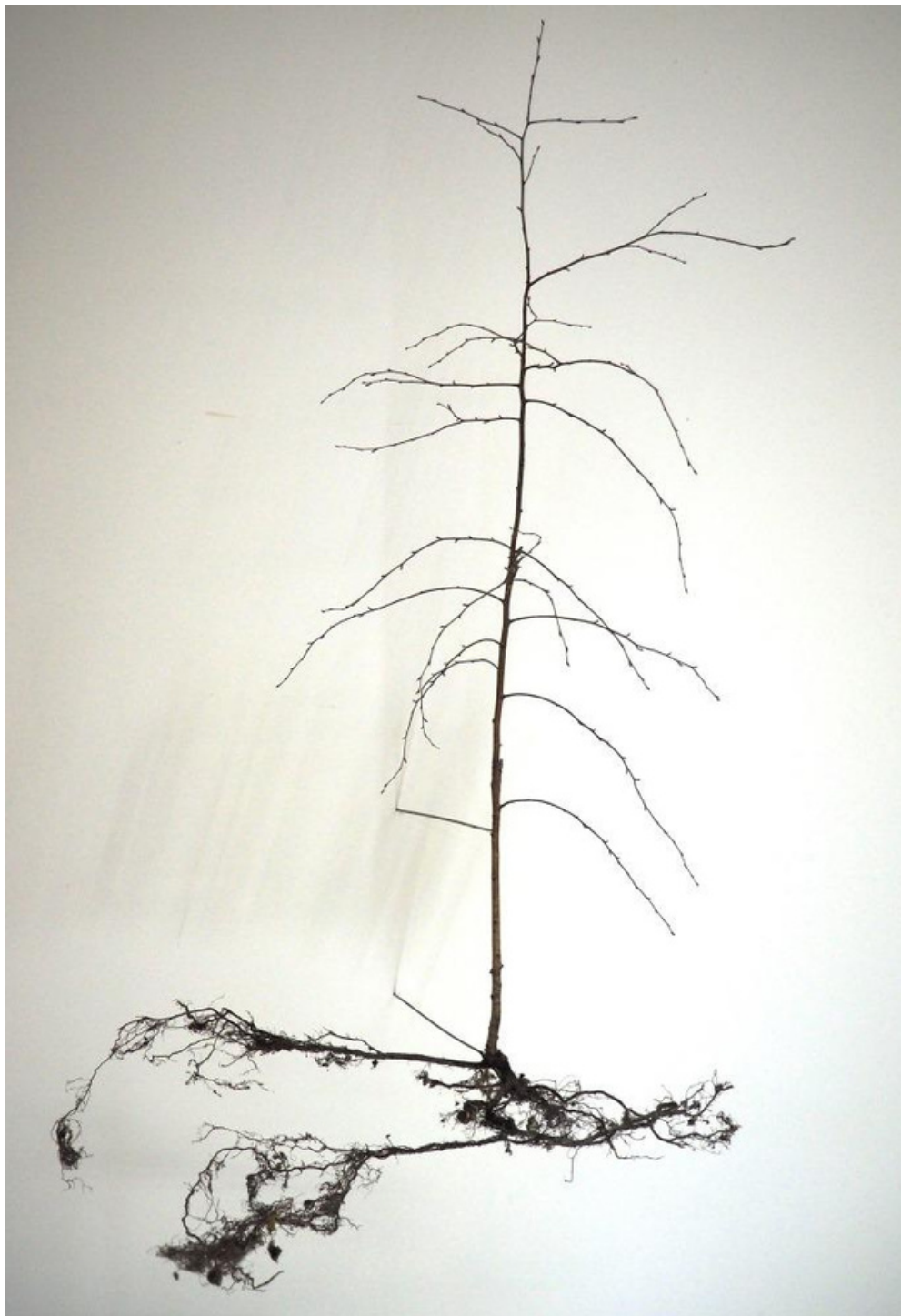
Détail d'installation, Architecture d'un arbre, 2022