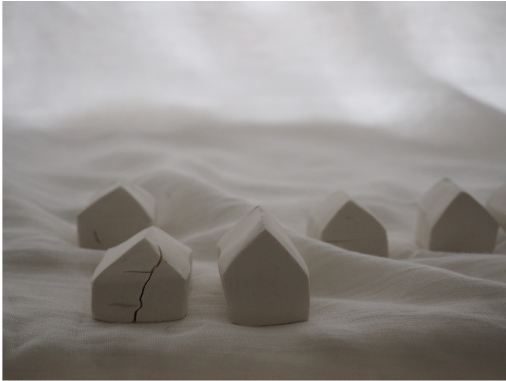
Installation, Demeures en porcelaine sur un paysage de voile, 2022