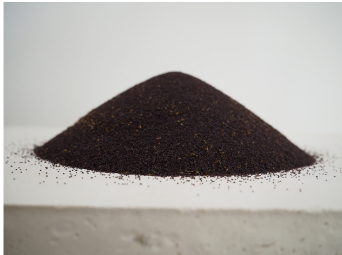
Détail d'installation, des milliers de graines