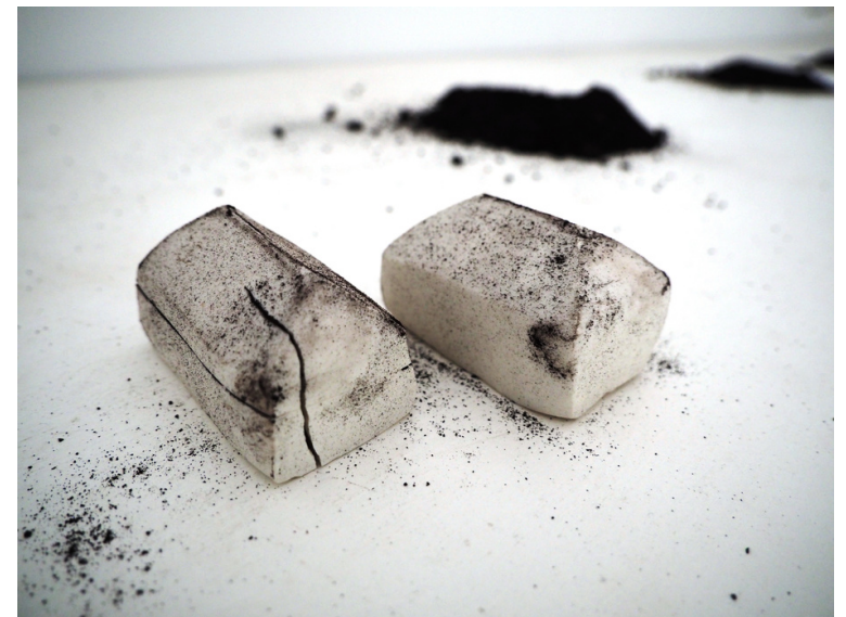
Détails d'installation, 2022