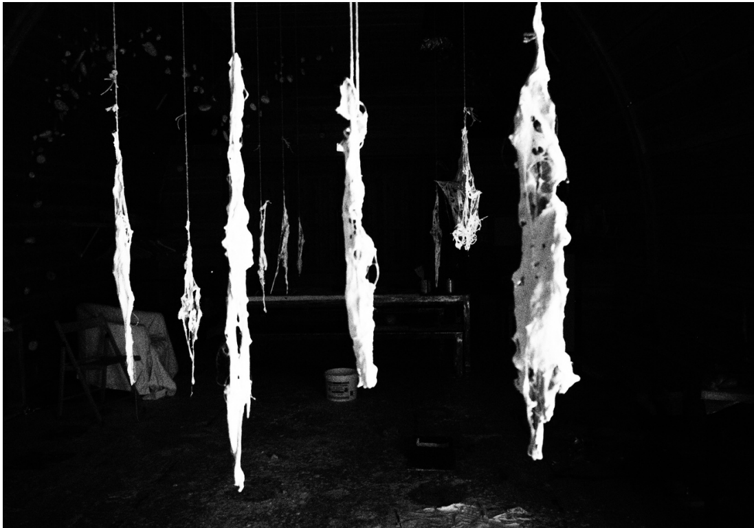
Installation, La chute, terre, porcelaine, fil, 2019