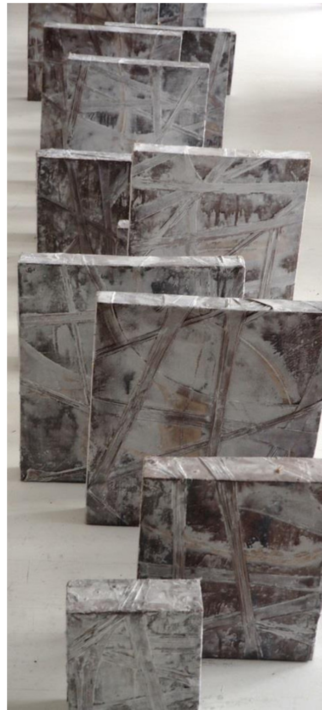
Installation, Isoler le savoir pour vivre le réel #2 , Blocs de cellulose, Bois recouvert d'une peau de latex, de bas et de talc, 2021