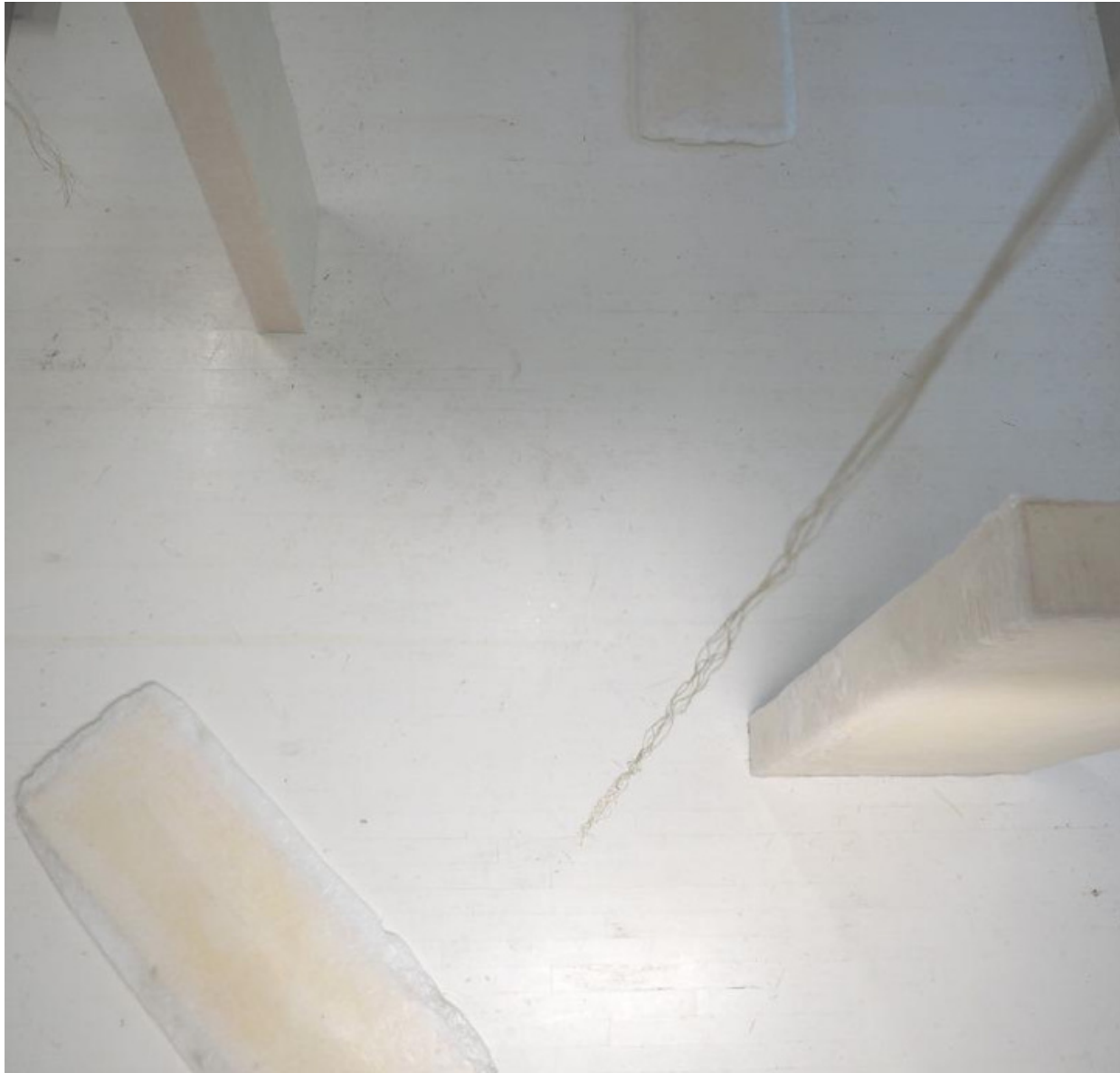
Installation, Contenir l'air dans une boîte en bois recouvert d'une épaisseur de paraffine , fil de lin poissé, 2022