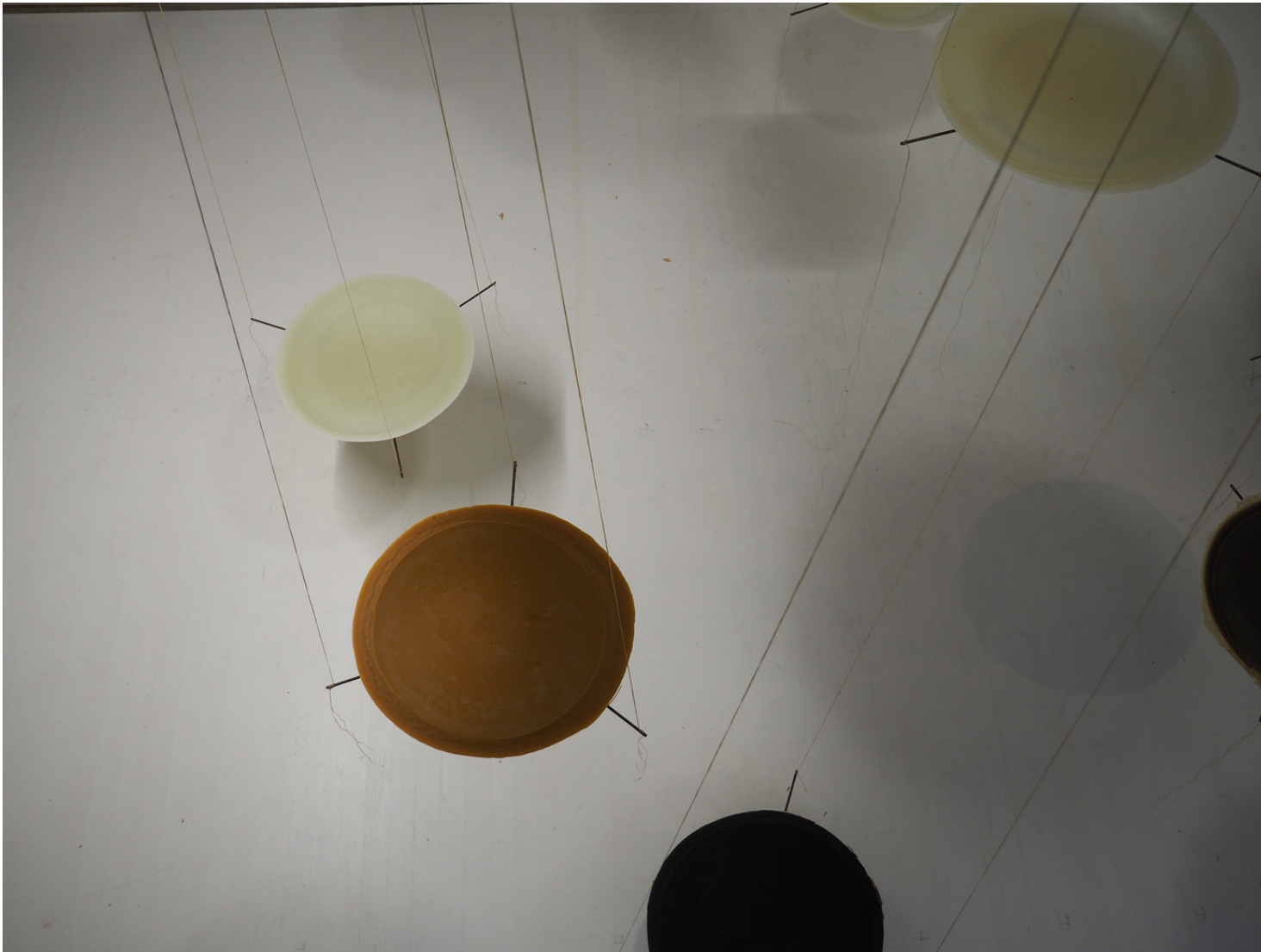
Installation, Réceptacles dissemblables de cire ou de paraffine tirés pourtant d'un même moule, 2020