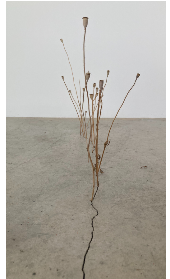
Détail d'installation, Calice sur tige