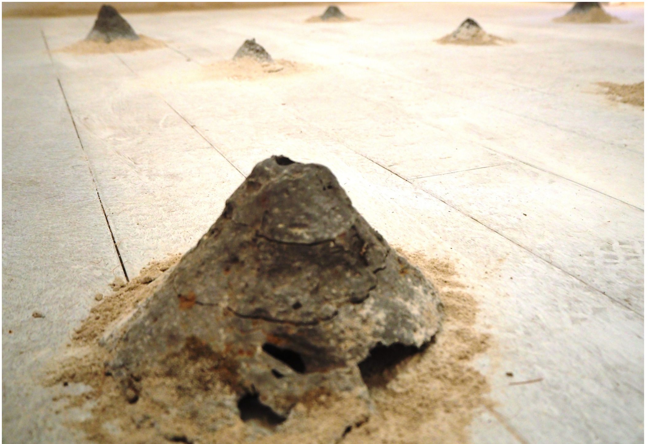
Installation, Isoler le savoir pour vivre le réel #3, Lettres d'imprimerie fondues sorties de terre, 2020