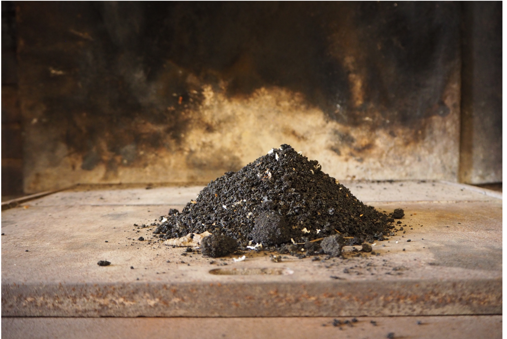
Installation, Foyer, Suie, 2020