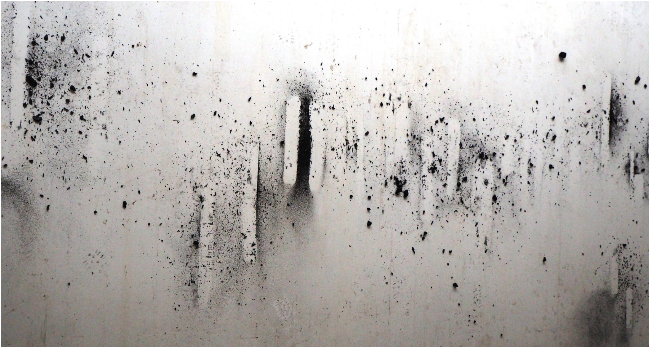
Installation, Traces d'un savoir, Résidus de bois passés par le feu, 2022