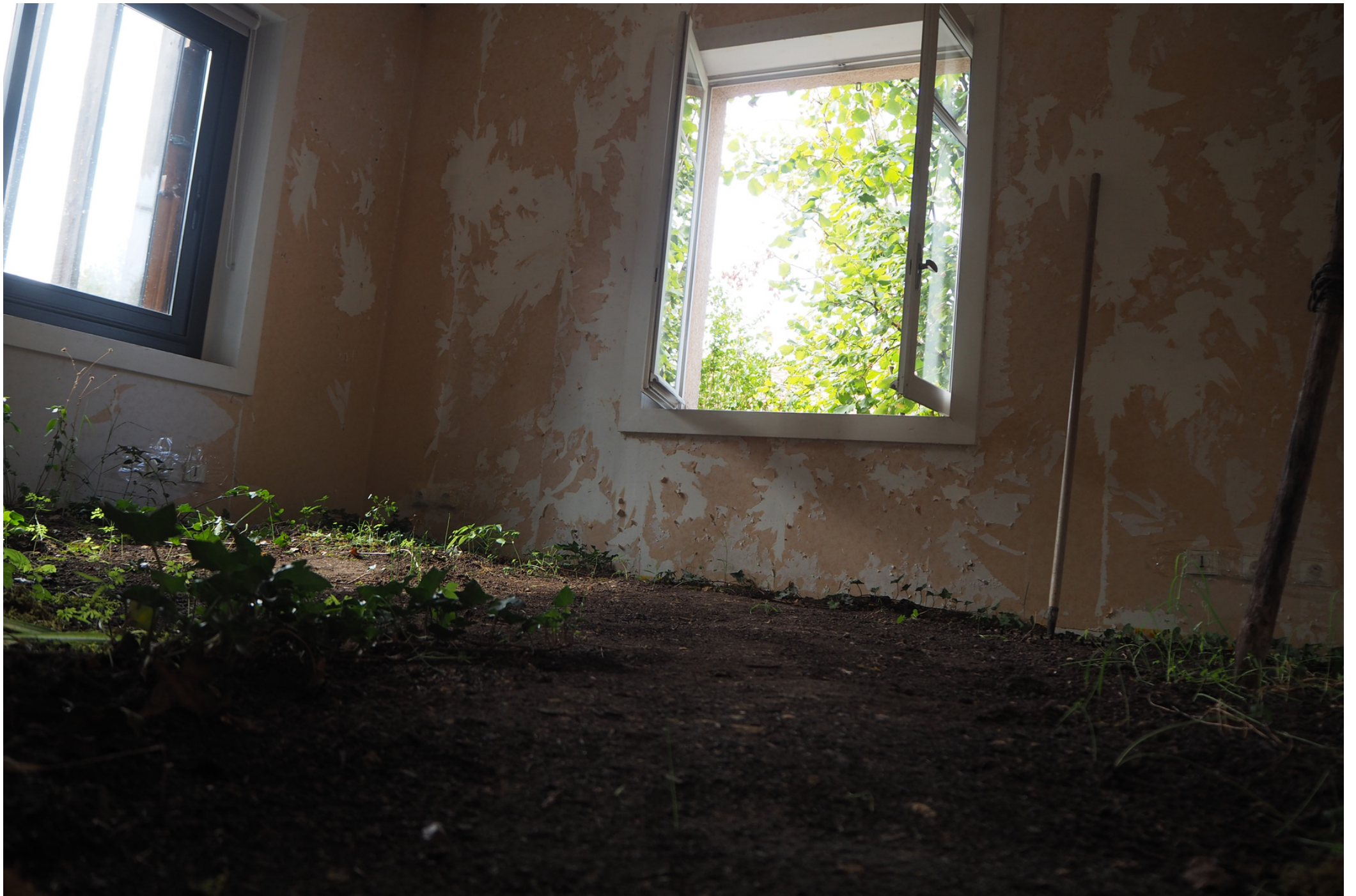
Installation, Jardin intérieur, 2020